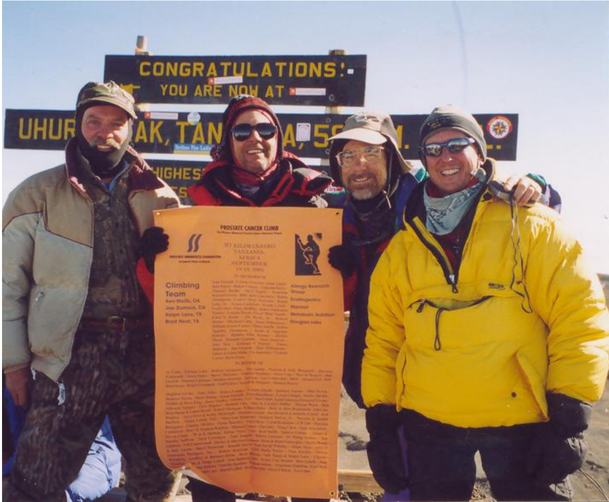
Kilimanjaro Prostate Cancer Climb