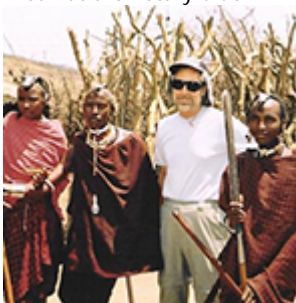
With the Masai