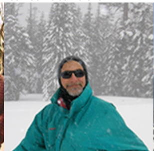
Snowshoeing at Mt Shasta