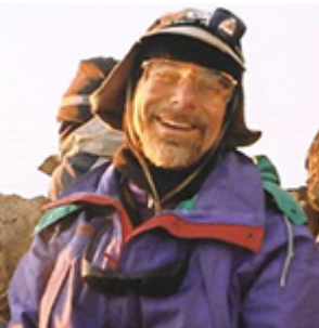
Gillman's Point- 18300 ft